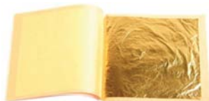
MT500 22-kt gold leaves 86x86MM