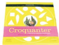
MT542 GEO CROQUANTER set of stencils for dehydrator