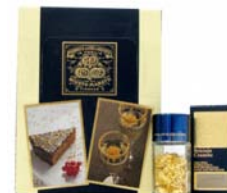
MT533 Gold crumbs in shaker