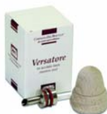
MT550 Balsamic vinegar stainless steel pourer