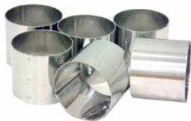
MT517 Valrhona Ethnao mould