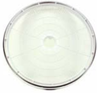
MT548 Tray for Ezidri dehydrator