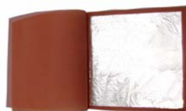
MT530 Silver leaves 86x86MM