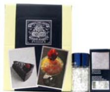
MT536 Silver crumbs in shaker