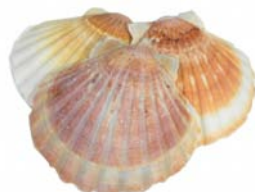
SM235 Scallops shells