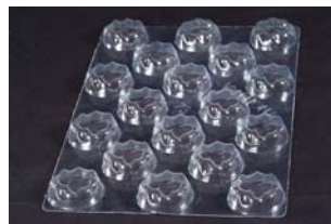
MT504 Valrhona 18-mould tray