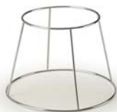
IAC410 Stainless steel tray stand