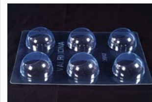
MT514 Valrhona Crescendo 6-mould tray / Crescendo Mould with 6 prints