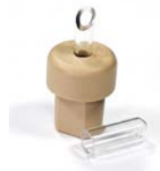
MT551 Balsamic vinegar "Sigillo" pourer