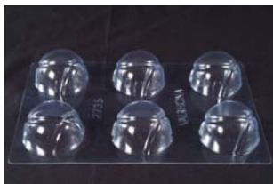
MT501 Valrhona 6-cavity Dome mould