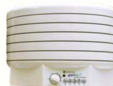
MT549 Ezidri Dehydrator