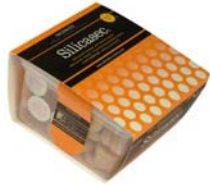
MT540 SILICASEC anti-humidity tablets