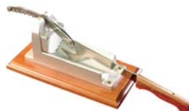
IAC300 Wood and steel oyster opener for bench work