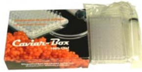
MT546 Spherification tool