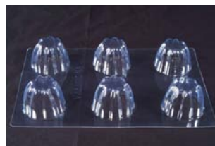
MT513 Valrhona Charlotte 6-mould tray