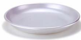
IAC416 Aluminium seafood tray d.50CM