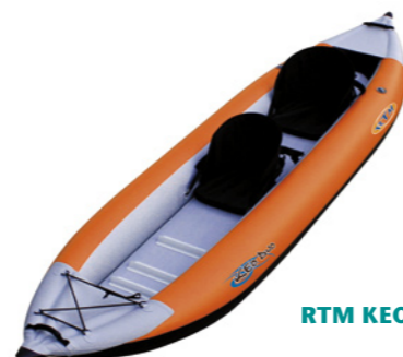
RTM KEO DUO

These kayaks are highly versatile, large and lightweight, they are adapted to both whitewater and lazy rivers. Unique self-bailing feature allows the option to open several valves on each side for quick draining.