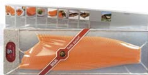
SM505 - kg. 1,2 Balik "Classic"