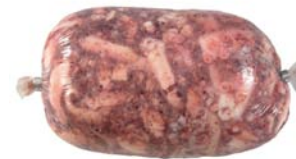
SM700 - g. 750 Steamed octopus "carpaccio" (thinly sliced steamed octopus)