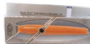
SM510 - g. 500 Balik Fillet "Tsar Nikolaj"