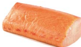
SM012 - kg. 1,8 Smoked swordfish (centre cut)