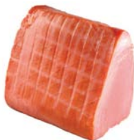
SM016 - kg. 2 Smoked tuna (centre cut)