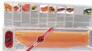
SM500 - g. 600 Balik "Small Classic"