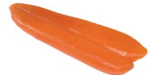
SM014 - g. 90-120 Mullet roe