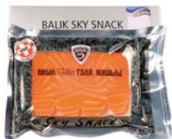
SM525 - g. 85 x 8 pc. Balik Fillet "Tsar Nikolaj" Sky Snack (4 medallions)