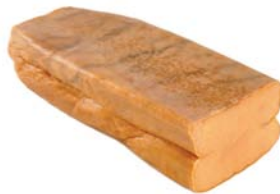
SM013 - kg.1-3 Swordfish roe 1-3kg