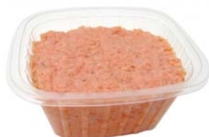
SM520 - kg. 1 Balik Tartar