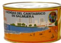
PEC100 - kg. 3,5 (drained) Salted anchovies from Cantabric Sea type "0" - 10pc/layer

Semi-preserved, smoked, ripened, salted fish