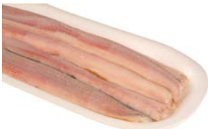
SM018 - g. 300 Smoked eel fillet (cleaned and skinless)