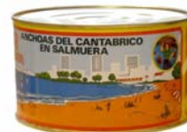
PEC102 - kg. 3,5 (drained) Salted anchovies from Cantabric Sea type "II" - 12pc/layer