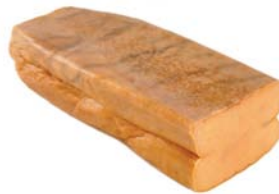
SM010 - g. 500 - 600 Swordfish roe 500-600gr slice pack