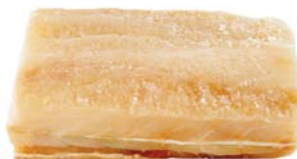
SM036 - kg. 1 Salted Ling fillet