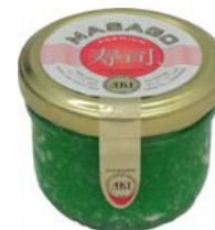
SM060 - g. 100 "Masago Wasabi" - Smelt eggs