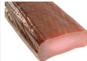
SM027 - kg. 1,5 - 2 Tuna "Mosciame"/Tuna ham (dried fillet)