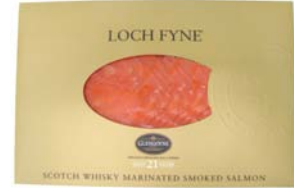
SM022 - g. 200 Whisky marinated slices of Scottish smoked salmon