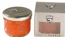
SM009 - g. 100 Balik Pearls (salmon eggs)