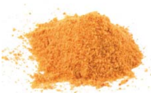
SM025 - g. 500 Grated mullet roe