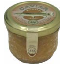
SM064 - g. 100 Pike eggs