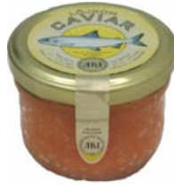
SM063 - g. 100 Whitefish eggs