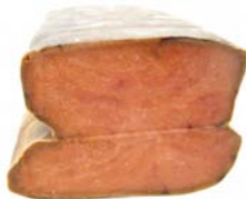
SM041 - g. 350 - 600 Red tuna roe - slice pack