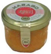
SM062 - g. 100 "Masago Soja" - Smelt eggs