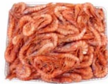
ZCIPS610 - +80 pc./kg. Red Prawn V +80pcs/kg