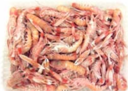
ZCIPS624 - 45+ pc./kg. Scampi IV Apulia +45pcs/kg