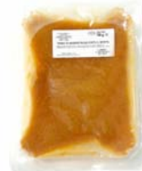
ZCISV415 - tray by g. 700 Prawns stock/base (Prawns from Apulia)