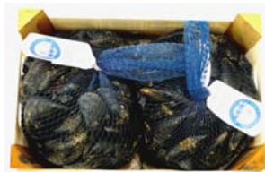
IMO256 - kg. 3 Black Mussel - Apulia (April - October)