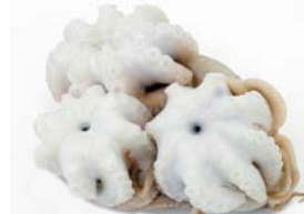
ZCIPS652 - g. 270 - 300 "Moscardino" baby octopus 270-300 gr medium size - Apulia