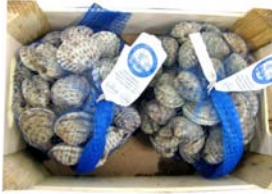
IMO254 - kg. 3

Sea truffle or Venus clam (October - May)