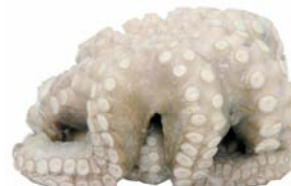
ZCIPS642 - kg. 4+ Curled octopus +4kg - Apulia