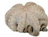
ZCIPS637 - g. 300 - 800 Curled octopus 300-800 gr - Apulia