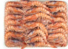
ZCIPS603 - 30 - 40 pc./kg. Rose Shrimp II 30-40pcs/kg