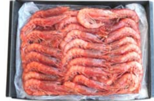
ZCIPS604 - 50 - 60 pc./kg. Red Prawn III 50-60pcs/kg