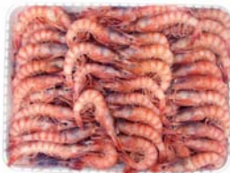
ZCIPS605 - 50 - 70 pc./kg. Rose Shrimp III 50-70pcs/kg