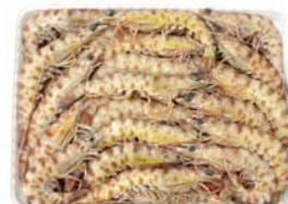
ZCIPS662 - 30 - 40 pc./kg. Tiger prawns II 30-40 pcs/kg