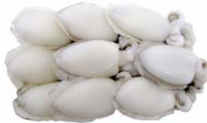
ZCIPS635 - kg. 5 Whole cuttlefish