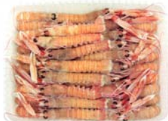
ZCIPS623 - 35 - 45 pc./kg. Scampi III Apulia 35-45pcs/kg