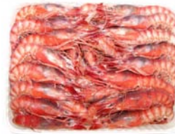
ZCIPS601 - 20 - 30 pc./kg. Rose Shrimp I 20-30pcs/kg