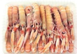
ZCIPS622 - 20 - 25 pc./kg. Scampi II Apulia 20-25pcs/kg