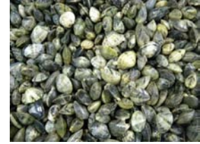
IMO248 - kg. 3

Medium size wild clam (November - April)