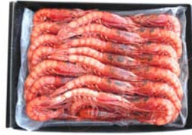
ZCIPS602 - 30 - 40 pc./kg. Red Prawn II 30-40pcs/kg