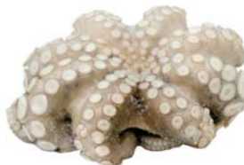
ZCIPS640 - kg. 2 - 4 Curled octopus 2-4kg - Apulia