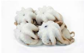
ZCIPS650 - g. 110 - 130 "Moscardino" baby octopus 110-130 gr small size - Apulia