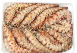
ZCIPS660 - 15 - 20 pc./kg. Extra Tiger prawns 15-20 pcs/kg