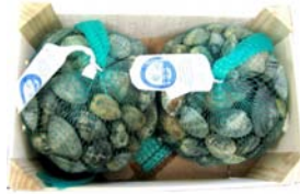
IMO252 - kg. 3

Sea truffle or Venus clam (October - May)