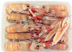
ZCIPS620 - 5 - 10 pc./kg Scampi Extra Apulia 5-10pcs/kg