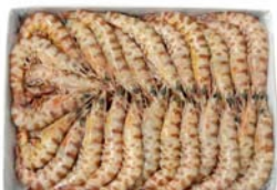
ZCIPS663 - 40 - 60 pc./kg. Tiger prawns III 40-60 pcs/kg