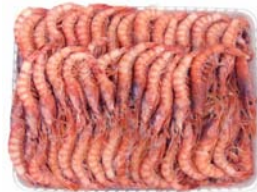
ZCIPS609 - 70 - 80 pc./kg. Rose Shrimp IV 70-80pcs/kg