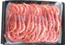
ZCIPS607 - 70 - 80 pc./kg. Red Prawn IV 70-80pcs/kg