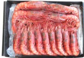
ZCIPS600 - 20 - 30 pc./kg. Red Prawn I 20-30pcs/kg