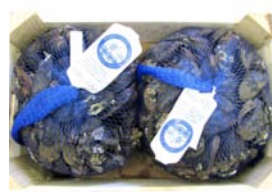
IMO258 - kg. 3 Hairy mussel (April - October)