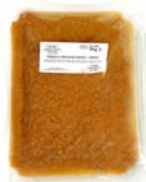
ZCISV416 - tray by g. 700 Crustacean stock - Apulia