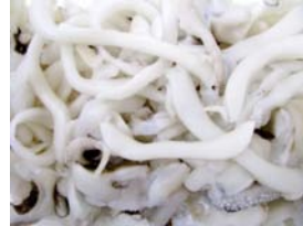
ZCIPS630 - kg. 5 "Tagliatella" cuttlefish